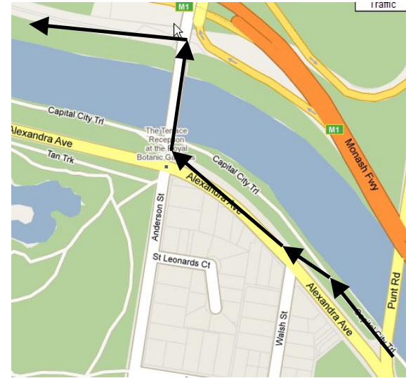
Detail 3 Morell Bridge (Anderson St) Leave bike path 50m after Punt Rd to go to footpath at higher level