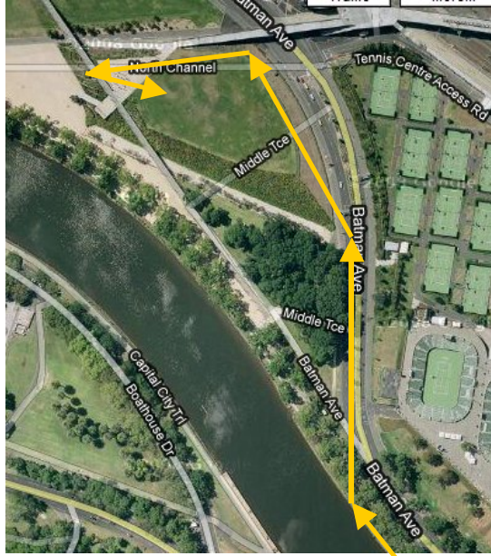
Detail 4 Leave main bike path and follow Batman Avenue until you pass under bridge. Turn left and follow path to next bridge. Turn sharp left up ramp to Federation Bells.