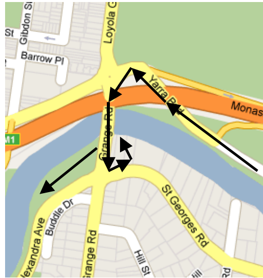
Detail 2 Grange Rd (Mac Robertson) Bridge Use underpass